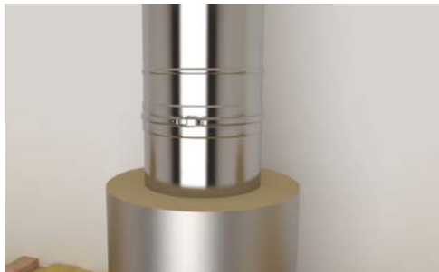
Additional components installed and secured with locking bands