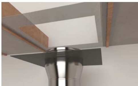
EPDM mat pulled down onto outer bead of ISC50 adapter