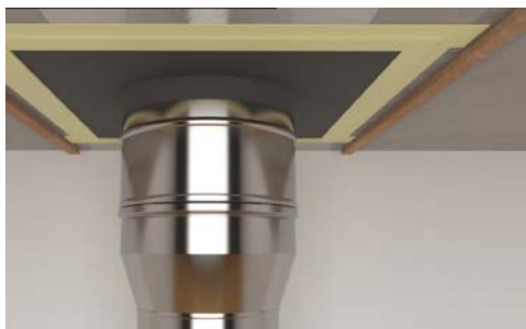
EPDM is attached to the vapour barrier using special tape supplied with EPDM kit