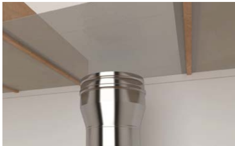
Existing vapor barrier