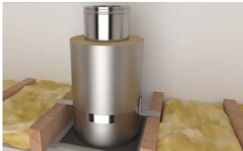
Protect Box lowered into position and fastened securely to the joists