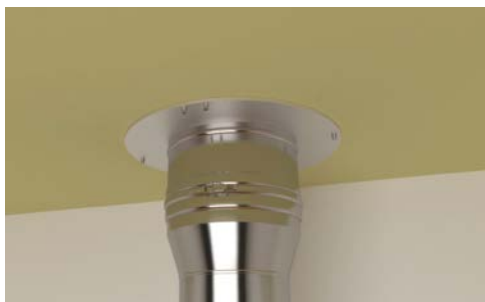
2-piece fire stop plate attached securely to joists