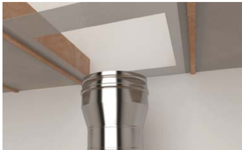
Square section cut out of barrier