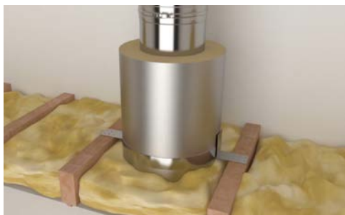
Insulation replaced around Protect Box